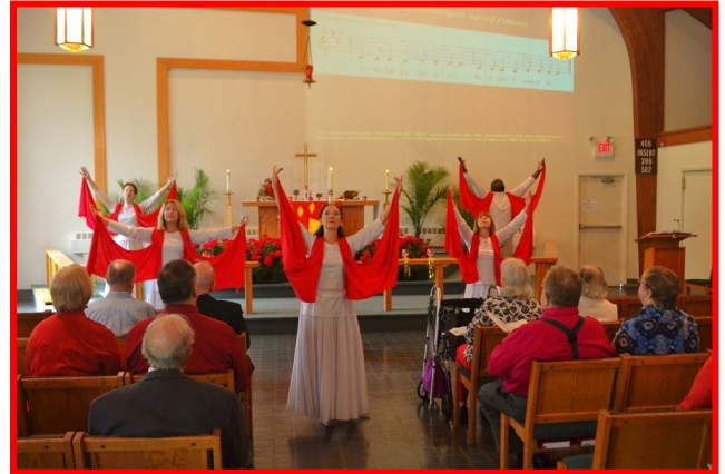
The Messengers Sacred Dancers